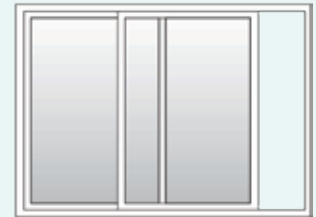
5102G Lift Out 2-Lite Slider

Available in various configurations, including three-lite models, these windows feature lift-out sashes to allow for easier cleaning.